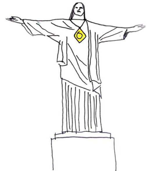
Something more ambitious...